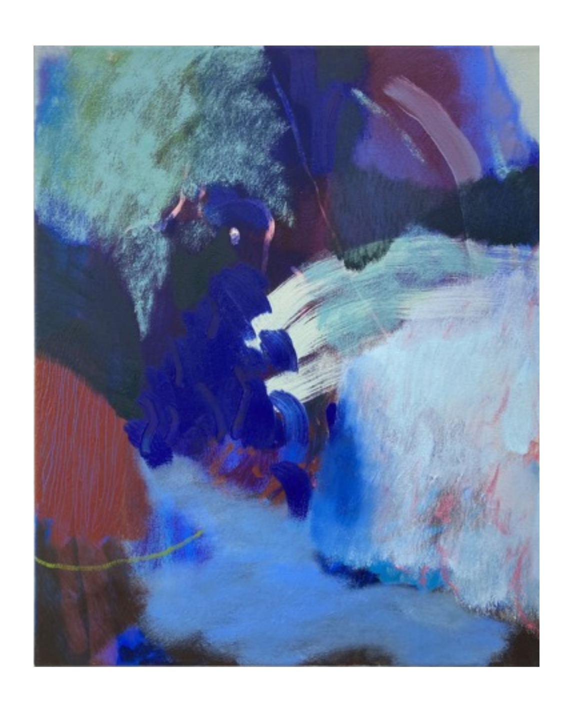
I peel off the skin of the day, oil on canvas 2022 45 x 55cm £1500