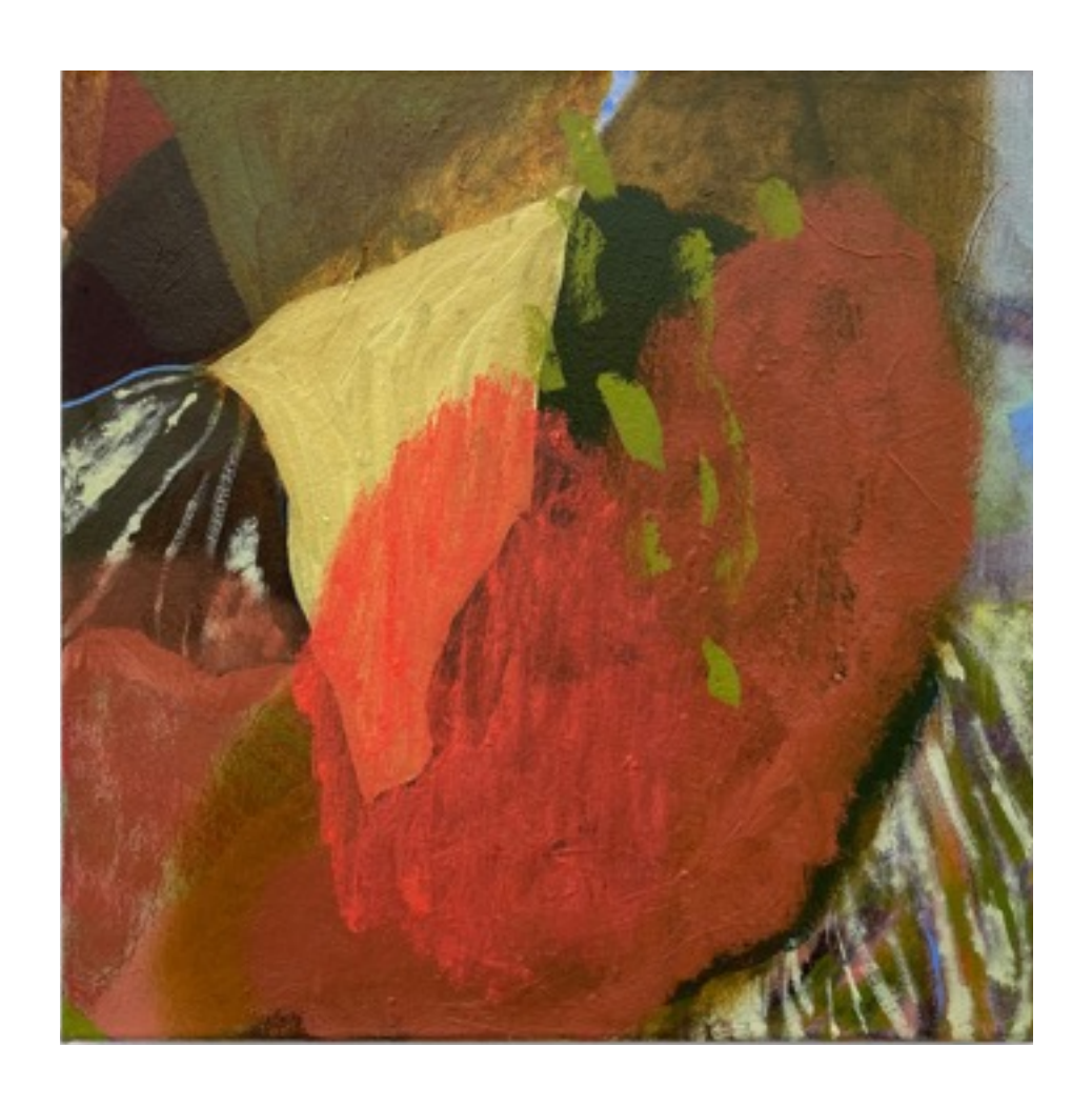
A backwards blink oil on canvas 2021 36 x 36cm £1100