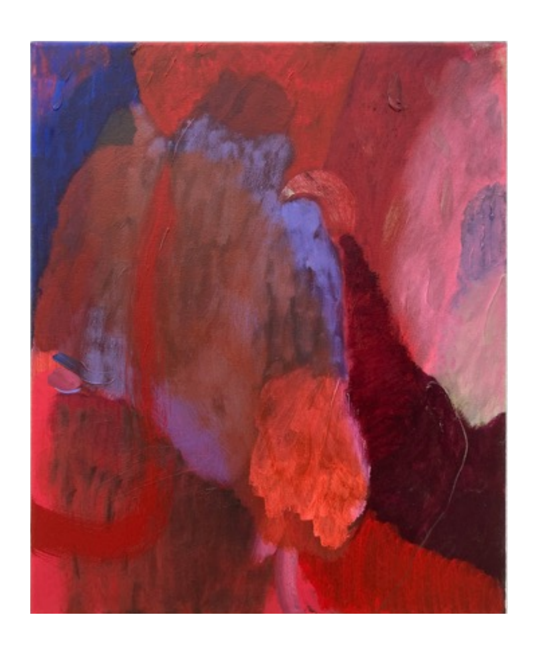
The pink ache oil on canvas 2022 45 x 55cm £1500