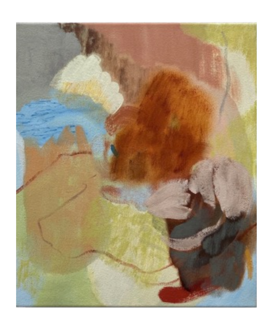
I come up for air oil on canvas 2022 31 x 36cm £1000