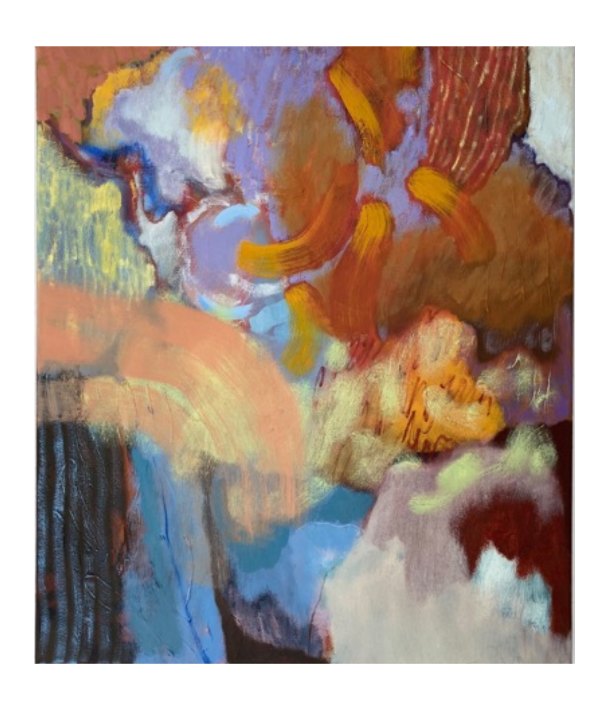
Looking directly at the sun again oil on canvas 2022 60 \times 70 \text{cm} £2100