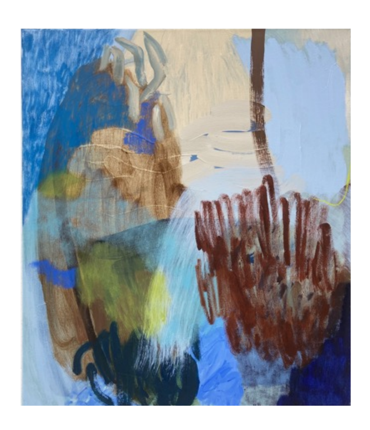
A heavy tether oil on canvas, 2021 60 x 70cm £2100