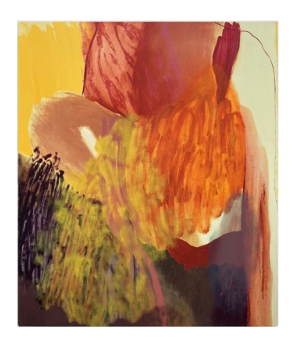
The light bounces back at me oil on canvas 2021 80 \times 100 \text{cm} £2900